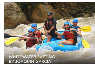
WHITEWATER RAFTING