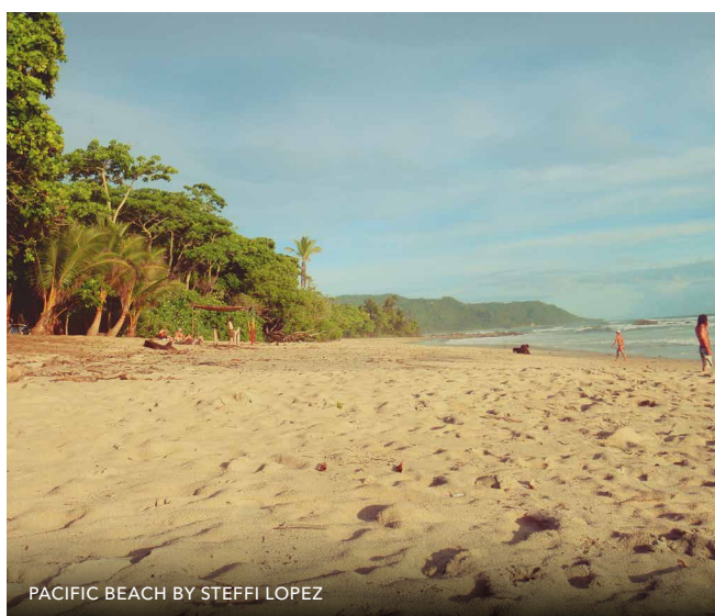
PACIFIC BEACH