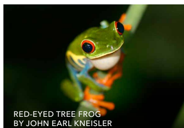
RED-EYED TREE FROG BY JOHN EARL KNEISLER