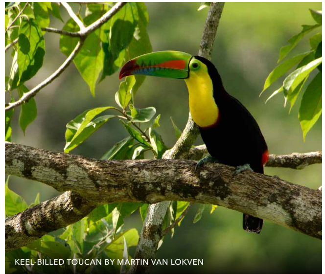
KEEL-BILLED TOUCAN